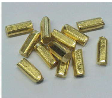
AuAs 0,4 % ø 5 x 11,1 mm slugs