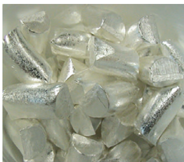
Ag 5N ø 13,5 x 25 mm slugs