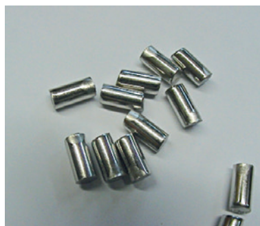
Pt ø 6 x 12 mm slugs

For alloys, which are not listed here, please contact us.