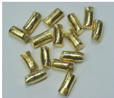
Au 5N ø 6 x 12 mm slugs