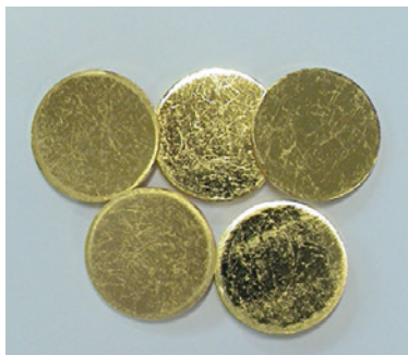
Au 5N ø 20 x 1,5 mm discs